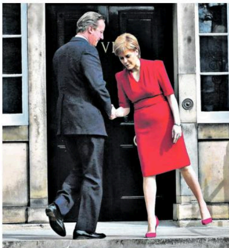
Scots threshold: Nicola Sturgeon welcomes David Cameron to Edinburgh yesterday

Under plans laid out by William Hague, the former leader of the House, in the last parliament, a committee of English and Welsh MPs will obtain a